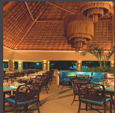
International Palapa Asadero