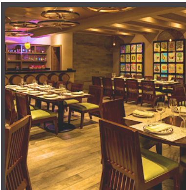
Mexican Los Caporales